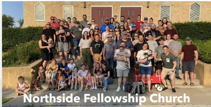
Northside Fellowship Church